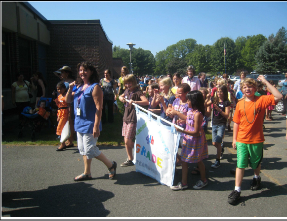
First Day Parade 2010